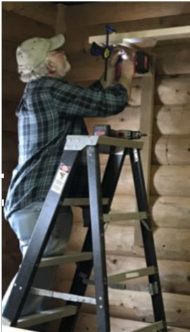
Fur Trade Post