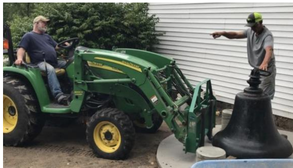
Moving the firehouse bell.