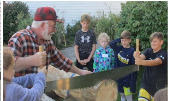
Teaching cooperation with a saw