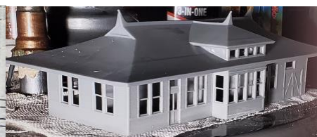
to rough model, to be displayed